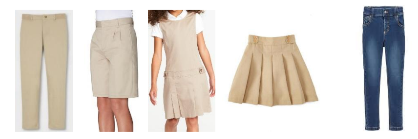
Khaki or Blue

Bottom: Pants, shorts, skirts, or jumpers. All bottoms should be khaki, blue, or blue jeans. No Torn Jeans.